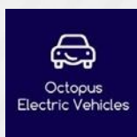
Octopus Electric Vehicles

An offer to purchase a cost effective way to get new cycling equipment and bicycles by spreading the cost and also making savings on your Tax and National Insurance contributions via our salary sacrifice schemes.