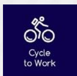
Cycle to Work

An offer to purchase home technology and personal electronic devices by spreading the cost and also making savings on your Tax and National Insurance contributions via our salary sacrifice schemes