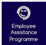
Employee Assistance Programme

Video or phone consultation with a GP at a time that suits you.